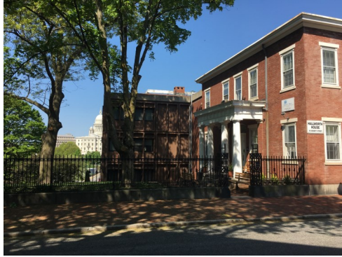
Hallworth House 66 Benefit Street

Governor McKee has announced a plan to care for homeless persons recovering from Covid in the former Hallworth House facility. Under the arrangement with the Episcopal Diocese of Rhode Island, which owns the building, 20 patient rooms will be rented by the State and furnished and staffed under the supervision of the Rhode Island Department of Health and the Office of Health and Human Services.