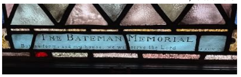
The plaque reads -But, as for me, and my house, we will serve the Lord-Jos XXIV 15