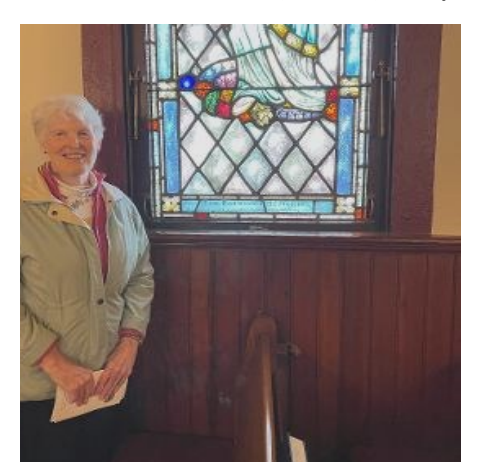
As you come into All Saints Church the Bateman Memorial stained glass window is on the right-hand side of the church.